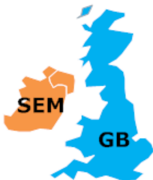
Figure 7: SEM and GB Bidding Zones

A geographical overview of the bidding zone delineations is given in following figure: